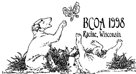
STYLE A—Indigo blue shirt with white pups, green grass, yellow and orange flowers and butterfly.

The Borzoi Club of America has done a wonderful job of "just in case" thinking by getting the Foundation started and continuing with their financial, as well as moral support. Although NBRF is separate from BCOA, the Foundation depends on their contribu-