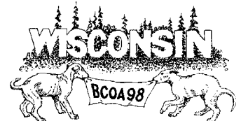
STYLE D—Sage green shirt with white pups, green trees and rust banner.