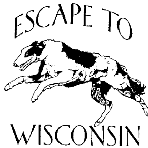
STYLE B—Charcoal shirt with black and white dog and shadow lettering.