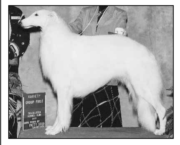
CH. PO DUSHAM PRIME DESIGN

Top Best Opposite Sex Borzoi Breed System