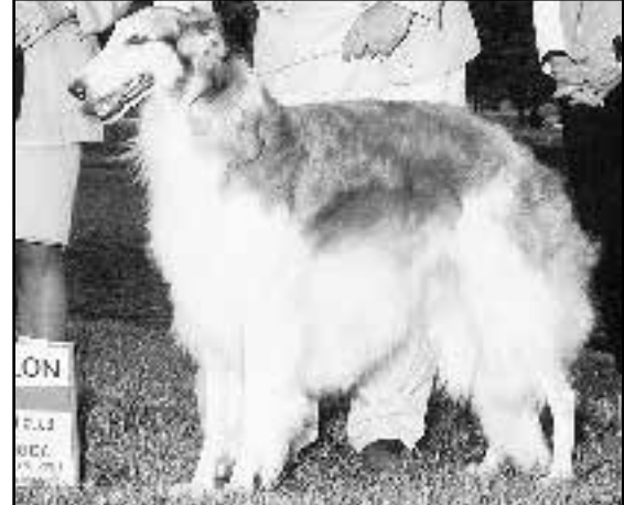
CH. VIRSHINA ROSE OF PARADISE, CD, SC, CGC